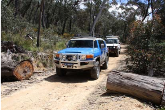
The built in chainsaw makes short work of obstacles like this, I wish!

Then we left early Sunday and went through Canberra to the Brindies. Spending the rest of the day sussing out tracks around the mountains and various alternative routes in case of bad weather, we eventually arrived back in Sydney around 9pm. The FJ went very well, the long range tank easily coped with the 900 kilometres we had driven and I averaged 13.5 litres per 100 k's which I was rather pleased with.