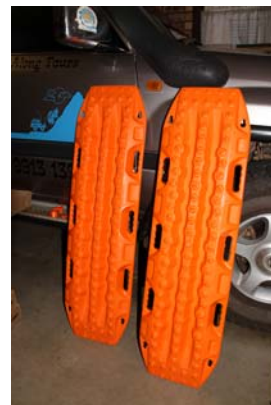
MaxTrax will make it a lot easier