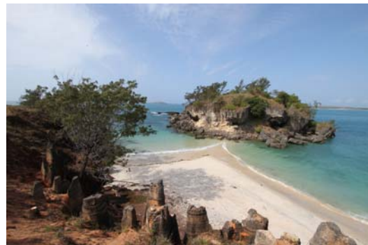
Arnhem Land scenery

As you know I did my reccie run into Arnhem Land during 2011 and I've now finalised the complete 19 day itinerary for an incredible journey into Arnhem Land next August 2012. I have just one spot remaining on the first of these trips and once that is full I'm planning a second trip immediately following it between August and September 2012. This will be a truly exciting trip into an area that is very difficult to gain access, we will even be going into places not normally open to the general public so if you have ever contemplated trying to see one of the last remaining frontiers of Australia take a look at the detailed itinerary for this trip, just drop me an email and I'll email it out to you.