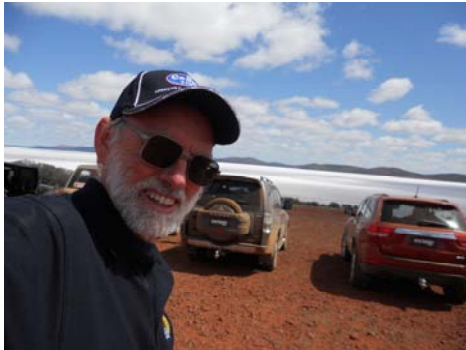
Row 3 4 from L

I thought I would take this opportunity to wish everyone a Merry Christmas and a safe and Happy New Year.