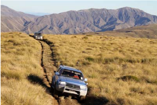
Stunning 4wd driving and scenery in NZ

have in Australia. I've done two of these trips now and can assure you that you will have one of the best trips you have ever done. Check out the trips on my website www.4wd.net.au