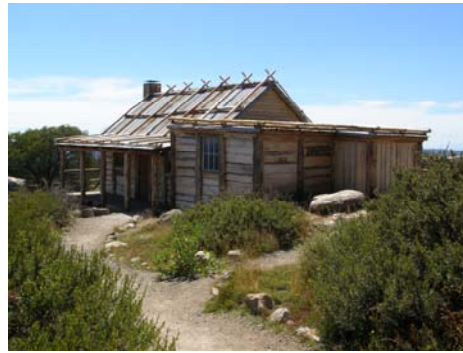
One of the many many many highlights of our High Country trip Craig’s Hut