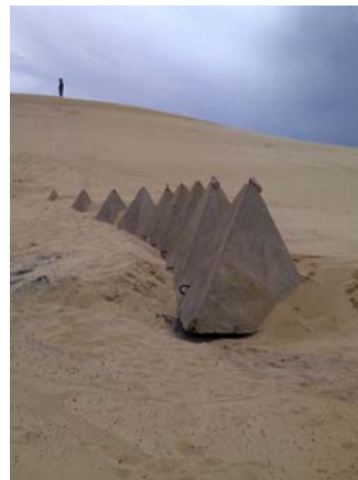
The tank traps at Stockton have become exposed again after being buried for about 18 months.