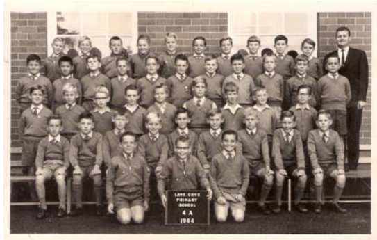
There is a hint as to which one is me, hidden in this newsletter

have my beard or glasses then! I'll give you a hint, I'm one of the boys.