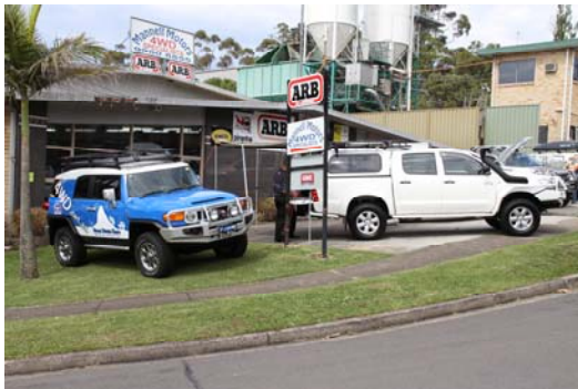
Mannell Motors at Thornleigh