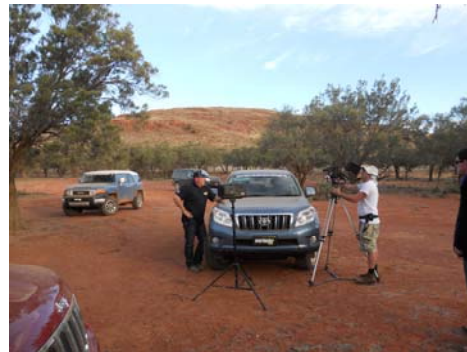
Look for the DVD on 4WDOTY with the January issue of Overlander magazine.

I must apologise as I originally indicated that my new book detailing 19 outback trips would be available in time for Christmas. Sadly this will not be the case and we are now looking at a March 2012 release date. I was asked to add in a few more tips and techniques to the book to make it the perfect package so this delayed the print run until 2012. But it has added value to the final product and it will certainly be worth waiting for. If you wanted to give this book as a Christmas present, no problem as I can issue a gift certificate for it now and will post out the book once it is available. A few people have already taken this option, so if you are after a copy for a Christmas present try the gift certificate idea. Just drop me an email at info@greatdividetours.com.au