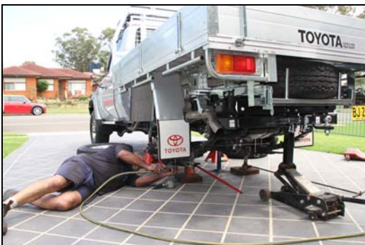
Fitting the Terrain Tamer suspension