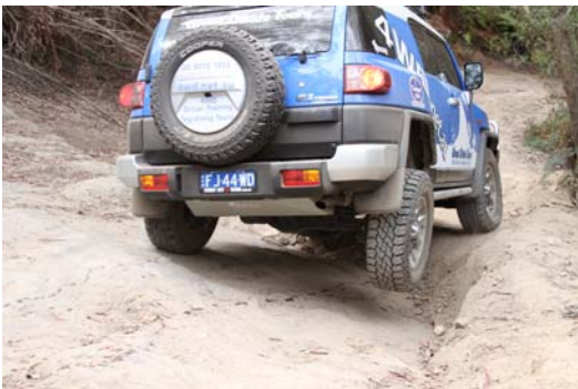
Oops, remember traction Vic!

Then we left early Sunday and went through Canberra to the Brindies. Spending the rest of the day sussing out tracks around the mountains and various alternative routes in case of bad weather, we eventually arrived back in Sydney around 9pm. The FJ went very well, the long range tank easily coped with the 900 kilometres we had driven and I averaged 13.5 litres per 100 k's which I was rather pleased with.