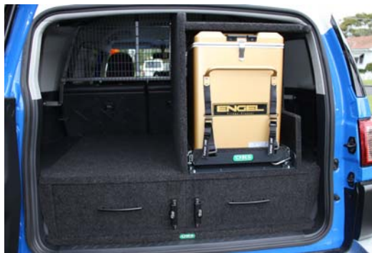
Check out the ORS drawers

To start with the FJ went up to Out of Town 4WD in Newcastle for the fitting of the 120 litre auxiliary fuel tank. These masters of squeezing as much capacity out of the smallest cavity did a great job on the tank installation.