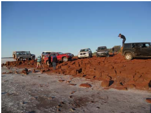
Photo shoot at Lake Gairdner

Back to 4WDOTY, for me the standout vehicle was the FJ, not again I hear you say; he keeps banging on about the FJ. Sorry, but at under 50k it is definitely the bargain buy of the year. I actually had the FJ top of my scoring list but the general consensus (and scoring) put the 200 series at the top followed on equal points by the Disco 4 and the Prado (even though it was in petrol form, if only Toyota had supplied a diesel Prado it would have probably scored second spot).