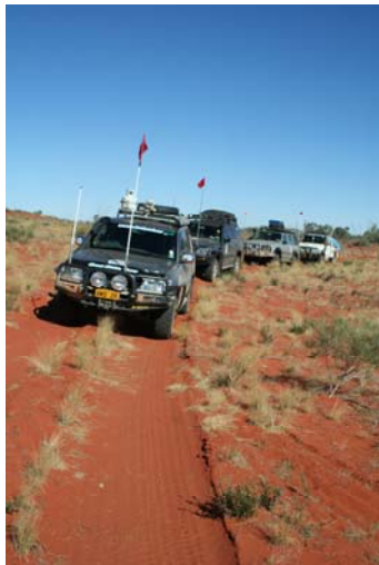
I bet we can't find this track next March

To me this sounded great and more reflective of what Reg Sprigg faced when he conquered the Desert back in 1962. So I'll be departing Mt Dare station on the western side of the Simpson Desert on the evening of 15 March 2012. The plan is to be the first person to cross the Desert in its anniversary year. It will be hot and fly blown and the desert dunes are likely to be straight up and straight down with peaked crests on each one. Each requiring a lot of shovel work. And we are hoping that Eyre Creek is not flooded like it has been the past 3 years.