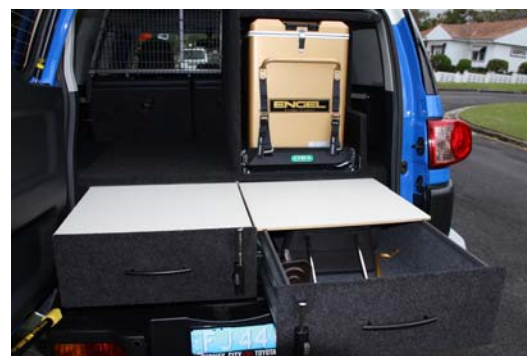
The ORS drawers double as a table top too!

Now that I had my fancy new gold edition Engel fridge in place I needed to power it. So the FJ went back to Artarmon Automotive to have power outlets installed in the rear cargo area for the fridge and some auxiliary lighting, plus the fitting of a second battery under the bonnet. Piranha reckon they had a battery and isolator kit for the FJ so we got one of these. Sadly, someone at Toyota must not be talking to the other Toyota reps, because, although there is space allowed for a second battery, someone has then plonked the power steering reservoir in the middle of it. The Piranha kit includes a bracket to relocate the power steering tank, but it is a really tight fit and we may need to modify the radiator hose location as it is just touching the power steering tank. Not good if this rubs through. And something we all need to keep a look out for when having extra bits added under the bonnet. It wouldn't be the first time we've had a radiator fluid leak because a pipe or hose has rubber through on a trip. Go check your radiator and heater hoses now.