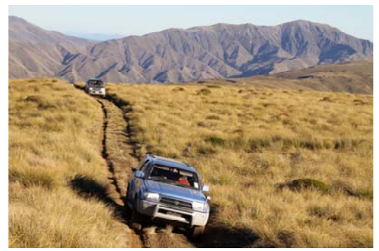
Stunning 4wdriving and scenery in NZ

have in Australia. I've done two of these trips now and can assure you that you will have one of the best trips you have ever done. Check out the trips on my website <a href="https://www.4wd.net.au">www.4wd.net.au</a>