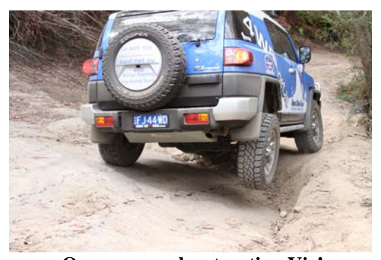
Oops, remember traction Vic!

Then we left early Sunday and went through Canberra to the Brindies. Spending the rest of the day sussing out tracks around the mountains and various alternative routes in case of bad weather, we eventually arrived back in Sydney around 9pm. The FJ went very well, the long range tank easily coped with the 900 kilometres we had driven and I averaged 13.5 litres per 100 k's which I was rather pleased with.