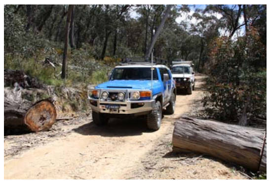
The built in chainsaw makes short work of obstacles like this, I wish!

Then we left early Sunday and went through Canberra to the Brindies. Spending the rest of the day sussing out tracks around the mountains and various alternative routes in case of bad weather, we eventually arrived back in Sydney around 9pm. The FJ went very well, the long range tank easily coped with the 900 kilometres we had driven and I averaged 13.5 litres per 100 k's which I was rather pleased with.