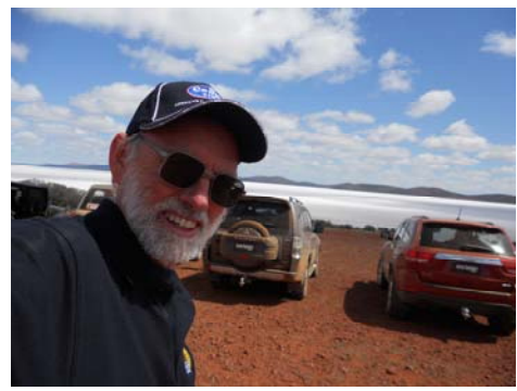
Row 3 4 from L

I thought I would take this opportunity to wish everyone a Merry Christmas and a safe and Happy New Year.