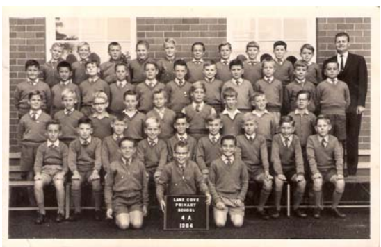
There is a hint as to which one is me, hidden in this newsletter

have my beard or glasses then! I'll give you a hint, I'm one of the boys.