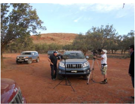
Look for the DVD on 4WDOTY with the January issue of Overlander magazine.

I must apologise as I originally indicated that my new book detailing 19 outback trips would be available in time for Christmas. Sadly this will not be the case and we are now looking at a March 2012 release date. I was asked to add in a few more tips and techniques to the book to make it the perfect package so this delayed the print run until 2012. But it has added value to the final product and it will certainly be worth waiting for. If you wanted to give this book as a Christmas present, no problem as I can issue a gift certificate for it now and will post out the book once it is available. A few people have already taken this option, so if you are after a copy for a Christmas present try the gift certificate idea. Just drop me an email at info@greatdividetours.com.au