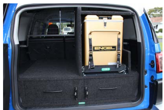
Check out the ORS drawers

To start with the FJ went up to Out of Town 4WD in Newcastle for the fitting of the 120 litre auxiliary fuel tank. These masters of squeezing as much capacity out of the smallest cavity did a great job on the tank installation.