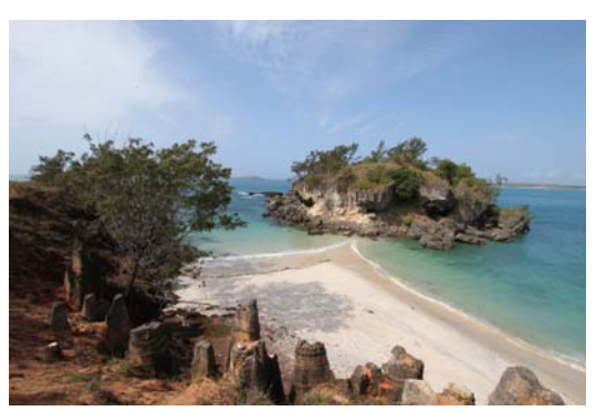
Arnhem Land scenery

As you know I did my reccie run into Arnhem Land during 2011 and I've now finalised the complete 19 day itinerary for an incredible journey into Arnhem Land next August 2012. I have just one spot remaining on the first of these trips and once that is full I'm planning a second trip immediately following it between August and September 2012. This will be a truly exciting trip into an area that is very difficult to gain access, we will even be going into places not normally open to the general public so if you have ever contemplated trying to see one of the last remaining frontiers of Australia take a look at the detailed itinerary for this trip, just drop me an email and I'll email it out to you.