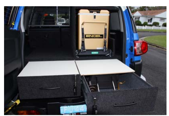
The ORS drawers double as a table top too!

Now that I had my fancy new gold edition Engel fridge in place I needed to power it. So the FJ went back to Artarmon Automotive to have power outlets installed in the rear cargo area for the fridge and some auxiliary lighting, plus the fitting of a second battery under the bonnet. Piranha reckon they had a battery and isolator kit for the FJ so we got one of these. Sadly, someone at Toyota must not be talking to the other Toyota reps, because, although there is space allowed for a second battery, someone has then plonked the power steering reservoir in the middle of it. The Piranha kit includes a bracket to relocate the power steering tank, but it is a really tight fit and we may need to modify the radiator hose location as it is just touching the power steering tank. Not good if this rubs through. And something we all need to keep a look out for when having extra bits added under the bonnet. It wouldn't be the first time we've had a radiator fluid leak because a pipe or hose has rubber through on a trip. Go check your radiator and heater hoses now.