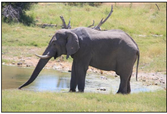
That's a big mouse!