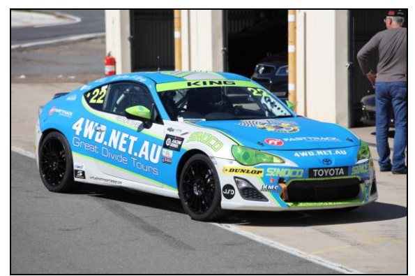
The 86 looks great in the GDT livery, make your dreams a reality!

Great Divide Tours became a major sponsor for the Bathurst round and the 86 looked stunning in its 4wd.net.au livery. We then had it on display at the Sydney 4wd show at Eastern Creek in October and it attracted a heap of attention.