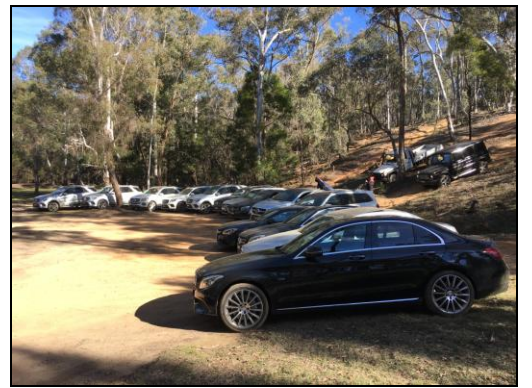
There was $1.5M worth of cars at our training centre!

But it's not just Government agencies that recognise our centre of excellence, we recently hosted a 4wd weekend for Parramatta Mercedes Benz with close to 70 personnel attending, we not only provided the catering, accommodation and training but I think we had the biggest collection of Mercedes cars and 4wdrives ever seen in Braidwood, check out the photo below.