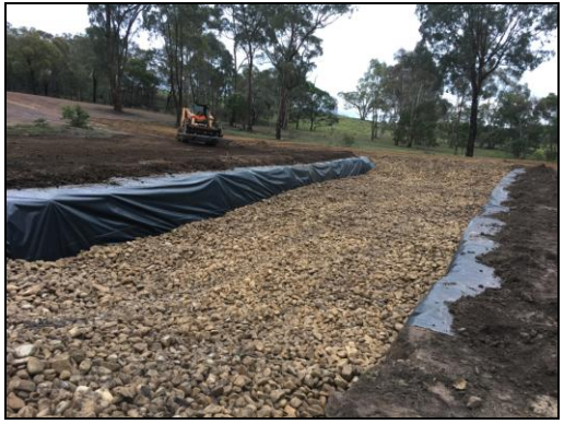
Waiting for the rain now

I'm expecting it will fill over the storm season in January and February but if not we will arrange for a very large water truck to attend the training centre.