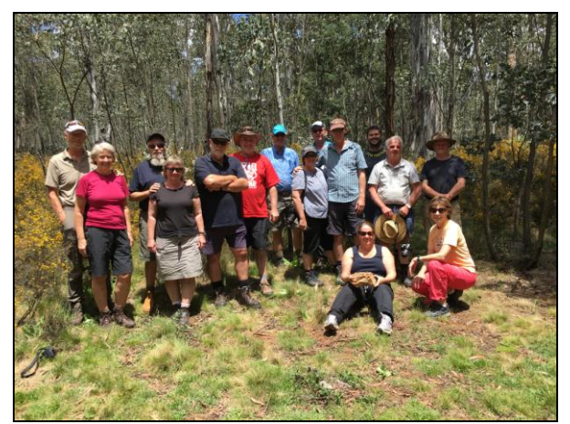
We had a fabulous time two weeks ago in the high country

Because we had missed Blue Rag and Billy Goat Bluff due to the car problem, we vowed to bring everyone back to see these iconic spots. This will take place from 25-28 March 2018 when I lead a special "High Country Highlights" trip. I have 2 spots available on this special trip if you would like to join us. We will visit Wonnangatta Valley, drive up Zeka Spur to Howitt hut, drive over Mt Wellington, and visit the Pinnacle Lookout, drive down Billy Goat Bluff Track and camp in beautiful Talbotville and depart the high country via Mt Blue Rag.