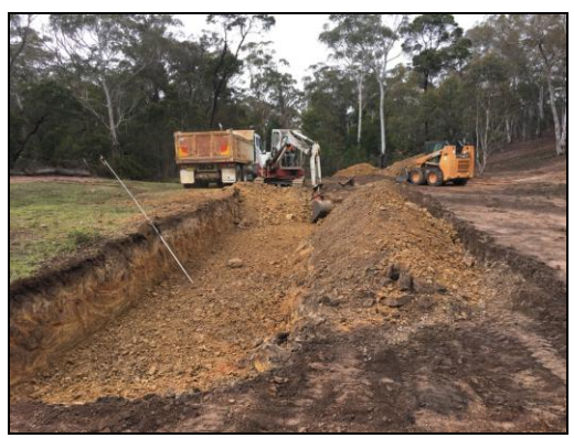
Digging digging digging

designing and building what will become a permanent water crossing. It measures 25 metres long, 7 metres wide and up to 700mm deep. We have dumped 50 cubic metres of river rock into its base to not only give a firm base to drive over (under water) but replicate a real river bed crossing, having just completed many of these in the high country I assure you it is as real as one can get.