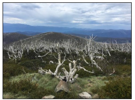
The scenery is amongst the best on our 4 day Snowy Trip

So finding about one full day of our trip now no longer accessible, we set about finding alternatives. And Wow! Did we find a couple of superb trails to replace them! If you like driving in snow gums and fantastic views, then you will love the changes we have made to our 4 day Man From Snowy River tour. We have two of these scheduled over the New Year period with each starting at Jindabyne. They then head off in different directions to meet up two days later before crossing over and completing where each commenced. The trips start from 11am on 29<sup>th</sup> December and conclude on New Year's Day, so if you would like to have a very different New Year's Eve take a look at this great 4 day tag-along tour. We offer it at Easter also.