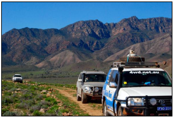
The Flinders Ranges is possibly the most underrated location for a 4wd tour

3-14 Sept 2018 Flinders Ranges has 6 spots still available