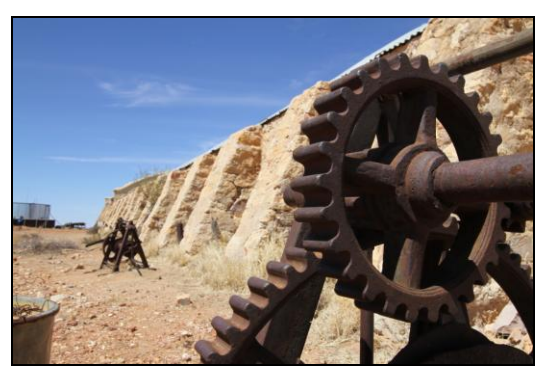
Cordillo Downs shearing shed

The format for these trips was quite simple, explore all the remote 4wd tracks through the Corner Country. Innamincka and Birdsville along with Marree and the famous Birdsville Track, but stay in the various country hotels and station stays along the way. Dinner and breakfast being provided at our overnight stops. If you have ever had a meal at a country pub you will know that the servings are huge, so no-one went hungry on these trips and some of the smallest pubs and roadhouses turned on the best meals. The weather during all 3 trips was perfect, although on my return trip we had quite a ferocious dust storm on one day, which allowed everyone to see (well almost see it) how the outback can change suddenly into a hostile place. we were all glad we didn't have to camp that night.