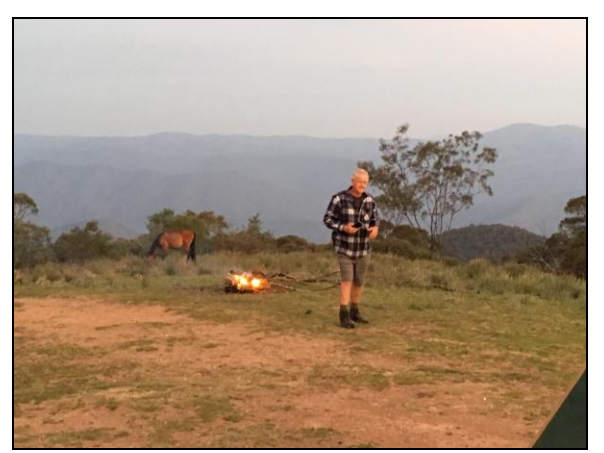
The Brumby that wandered into our camp on Mt Meenak (in the background, not Neill)

360 degree views. I decided this would make a great camp site for us, barely enough room to erect our single tent, it's not a spot I would normally choose (by the way – we found an even better camp the next day to use on the tour). After setting up the tent and as the sun set over Mt Kosciuszko We were startled to look up and see a wild brumby had wondered into our camp and was standing just 10 metres away from us. The brumby stayed all night, we could hear is hoof prints throughout the night around the tent and the next morning whilst being disappointed that a thick fog had enveloped our mountain we were delighted to see our brumby friend still keeping us company. A magic moment in the high country for sure. We saw several more brumbies during our reccie and although these are feral animals and can cause a lot of damage to the fragile alpine land, they are certainly a grand sight running through the snow gums.