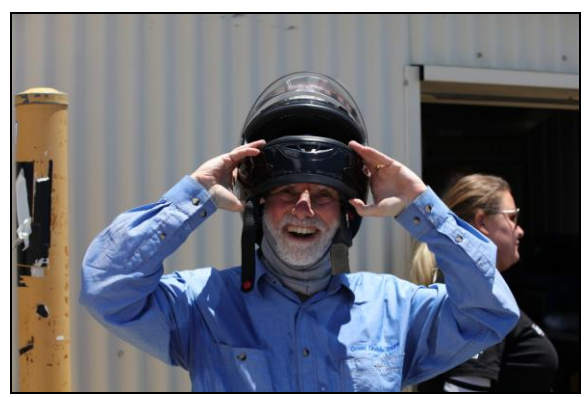
10 mins in the race seat and I was done!

Now for next year's series and accomplishing that dream of winning a championship.