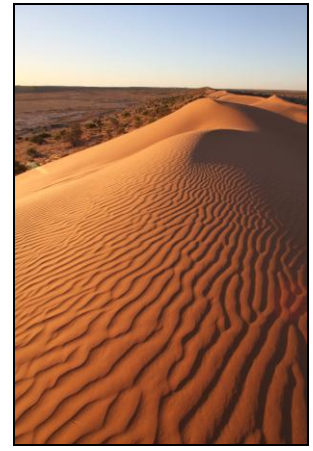
We enjoyed sunset on Big Red

During each of the trips there was a lot of talk about other possible venues for this type of accommodated trip and I have a couple in mind including the Flinders Ranges and one down the Darling River Run, all I need is the time to plan them and get them on my already very busy calendar, but watch this space as they say.