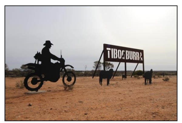
Great scenes throughout the outback

We held the first of these fully accommodated trips during September and they were certainly a great way to see the outback. In fact, we ended up with an overwhelming response and finished up running 3 trips during the month. Ty and I led two of them, back to back, with the first trip concluding in Port Augusta after visiting Birdsville, and then our return trip commenced in Port Augusta and went to Cobar via Birdsville. Dave Fullerton, who was just a few days back from his two Cape York trips, led the third trip and we passed him on the Cordillo Downs Road on our return trip.