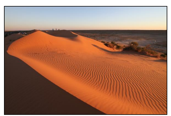
Join us on our fund raising outback bash in late September.

To register or for more details drop me an email at info@4wd.net.au See the flyer attached to this email newsletter.