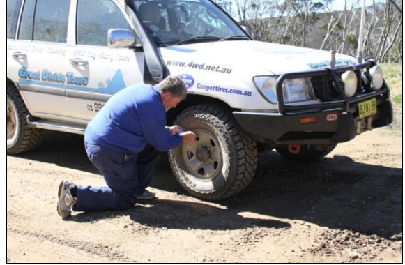
Even the tyre experts know to drop their tyre pressures when off road.

I use 25 psi when off road and lower of course when on sand, around 17 psi.