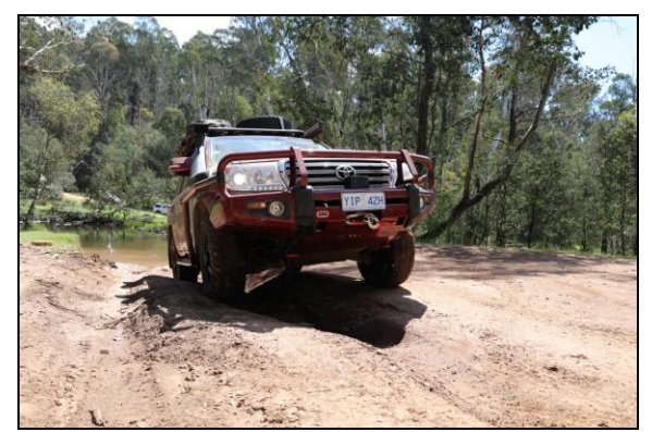
The Fat Corolla heading into Pineapple Flat

The week prior to all the rain, Neill Bell and I led the 7 day high country camping trip with a great group of people. We had many highlights on this trip not the least was the fabulous scenery that the high country has to offer.