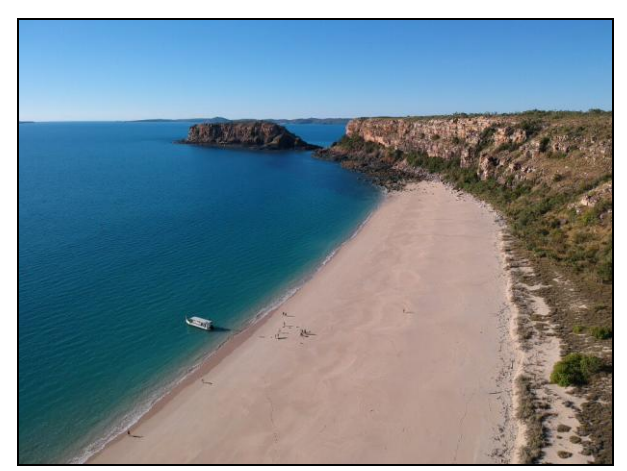
Tick your Bucket list with Vic

food amazing and I can't think of a single thing not to like about this trip. I have 7 of the 10 cabins filled so we have just 3 twin cabins remaining, see here for the details <a href="http://www.greatdividetours.com.au/4wd-tours/extended-safaris/cruise-the-kimberley-coast">http://www.greatdividetours.com.au/4wd-tours/extended-safaris/cruise-the-kimberley-coast</a> Don't miss out on this trip, it is a real bucket list item and worth every red cent of the tour fee.