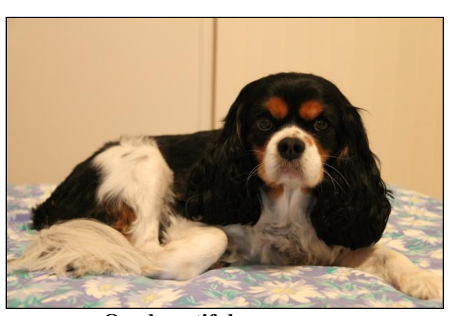
Our beautiful pup