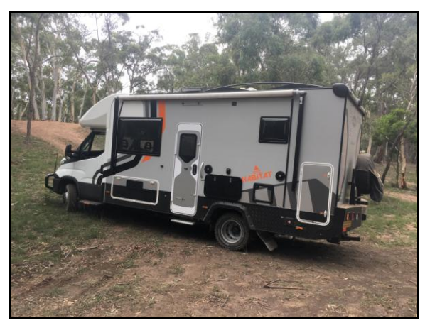
2WD with rear diff lock, still goes places Sad news

And its not always about 4WD training either: just this week we helped the lovely owners of this 2WD Iveco with a large motor home body attached learn where they can get to with their motel on wheels. Working with vehicles in an off road environment has taught me so much about vehicle dynamics and how to read the terrain, and its my pleasure to be able to pass on what I've learnt so you can enjoy exploring our great country.