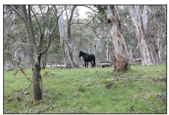
The black stallion 10 March 1 day Turon River 4wd trip — A great single day escape from the rat race of Sydney, bring the family on this 4wd tag-along through the Turon River NP just west of Lithgow - Cost is only $250 per vehicle.

2-3 March Next weekend – a 2 day camping trip to the beautiful Brindabella's and Snowy Mtns region south west of Canberra, camp amongst the snow gums and wake to the sight of a brumby stallion in the crisp mountain air. We have 2 spots remaining.