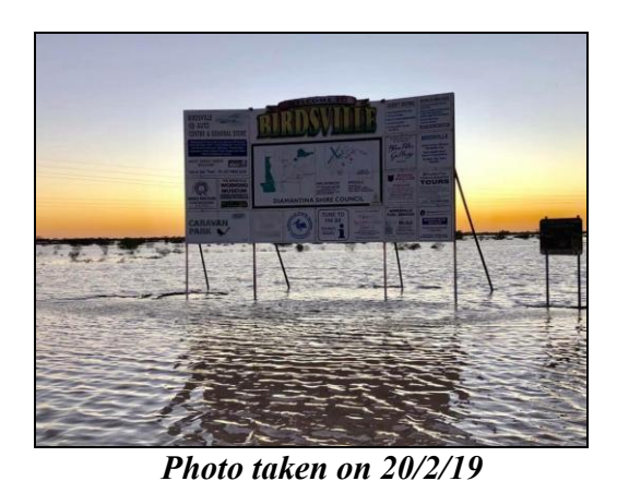
Day 3 Monday 25<sup>th</sup> March Up early for

In the afternoon we follow the Oodnadatta Track down to William Creek where we land. We will stay tonight in the great ensuite cabins and have dinner and breakfast next day in the Hotel.