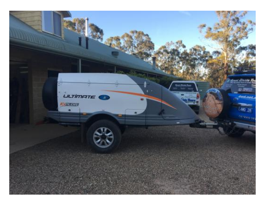
Its for sale and its like brand new

If you are looking for a great off road trailer they don't come much better than this one. I purchased it off one my customers last year and now have it up for sale. For just $48,500 this 2014 Xplor Ultimate could be yours. The other good news is that Ultimate Campers based in Moruya on the south coast of NSW which had gone into receivership has been purchased by another camper trailer business and they have re-opened the Moruya assembly plant and continue to market the Ultimate Campers, which is fantastic news for a great Australian made product. Give me a call on 02 99131395 if you would like to have a look at my Ultimate.