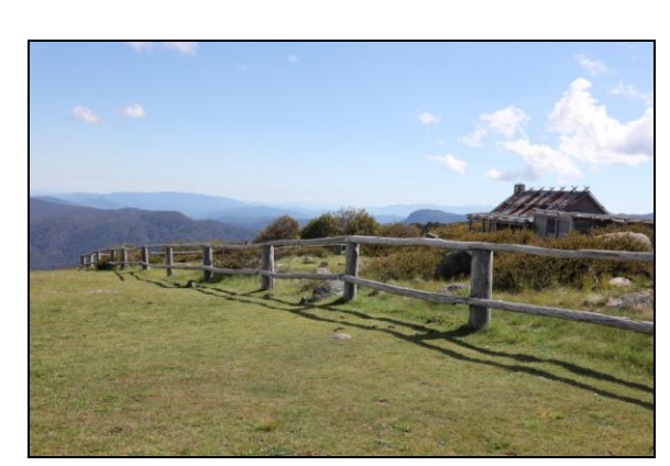
Nothing more iconic than Craig's Hut

Accommodated Tour – Want to see the High Country but don't want to camp or cook? This is your trip. Starting in Bright we will visit all the iconic locations in the high country and then duck out of the Mtns each evening to enjoy great accommodation and even better meals in places such as Bright, Mansfield, Maffra, Dargo and back to Bright. Contact me asap for this one, or if you can't do this at such short notice we have the same trip on again from 25 May – 1 June 2019