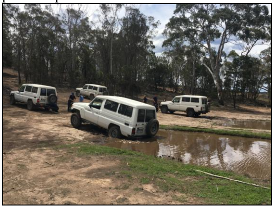
Lots of 4wd training already

To say that we are a little busy with our driver training is a slight understatement. It is a credit to the work that we perform that we are so busy. We now have 4wd courses on virtually every day at the training centre. Our usual weekend courses for you guys, our Mums and Dads, is booked out every month. The camper trailer courses are so busy that we have now put on three extra courses already, our private individual courses are extremely popular and our corporate work is very busy with us delivering courses thus far this year to the AFP, ADF and Snowy Hydro. So thanks for all the support that you give us by attending our training, we endeavour to make it the best available with best practise procedures.