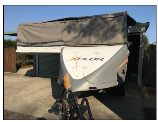
Call me if you are after an Ultimate