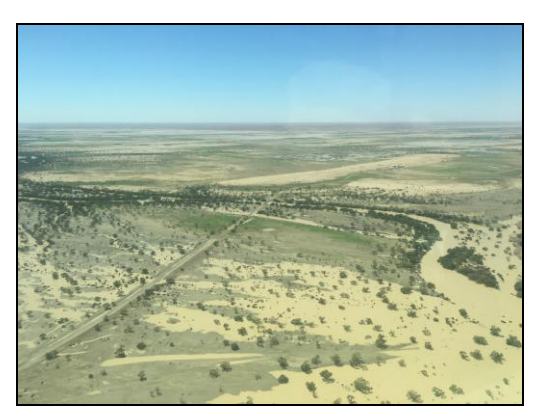
Inside Birdsville Track flooded for the rest of this year

We did a couple of fly pasts of the head waters of the flood and then followed the flooded Warburton River though the drought stricken landscape of the Great Stony Desert to Clifton Hills station. We saw firsthand the Inside Birdsville track under water for many many kilometres which means it won't be open this year.