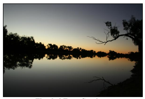
Flooded Eyre Creek

wildflower display. So here is a trip hot off the press, (I just designed it today!) that will take you to the green outback to see it like it has not been seen for years. It is a camping trip but you can bring your off road trailer.