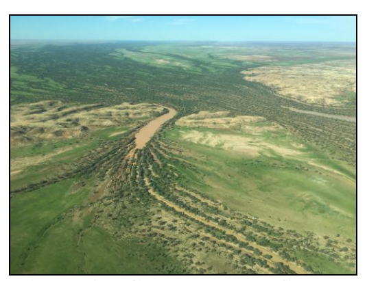
Diamantina Gates where the Channel Country narrows before spreading out for over 80 kilometres wide, all green now.

the previously flooded Channel country was now a vivid green. It is amazing how quickly the vegetation returns after such a prolonged drought. We flew over the Diamantina Gates where the flood channel narrows to just a few hundred metres and all the flood waters from up north had squeezed between the two rocky cliff faces. I was even able to spot a camp I had used on the edge of Hunter gorge in the national park.