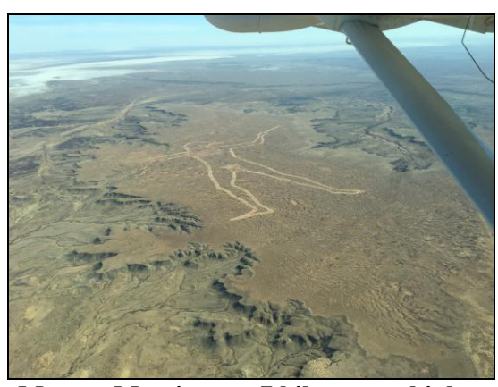
Marree Man is over 7 kilometres high, lucky he is laying down!

Birdsville to see the flood waters coming down the Diamantina channel country. In the end I managed to fill 2 plane loads and unfortunately we did have a couple of clients miss out as we needed 11 bookings for each plane to go at the price we quoted. Both trips proved to be outstanding, flying into Adelaide late on Friday evening and then at 7am boarding the mining plane to Olympic Dam and then before we knew it we were flying over Marree Man in our 12 seater Cessna Caravan from Wrightsair.