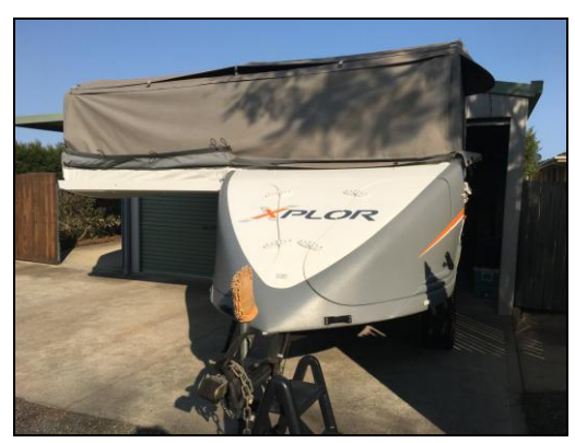
Call me if you are after an Ultimate