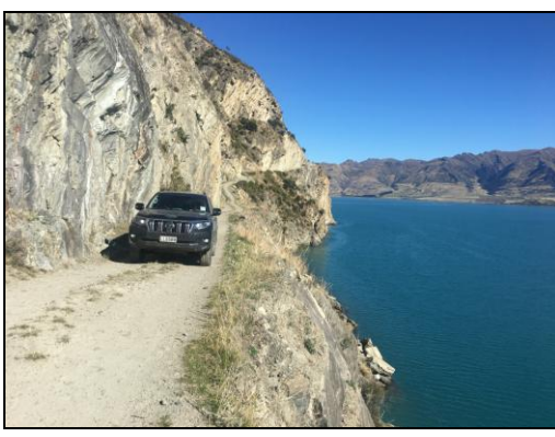
Tight track beside a blue lake