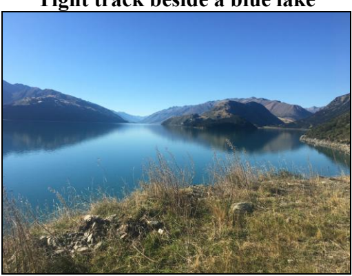
Lake Haweka in NZ