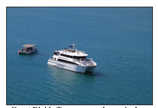
Great Divide Tours, more than a 4wd tour company, we are your ticket to the best the world has to offer.

How do I describe this trip? I've done a lot of travel in and around Australia over the past 45 years and the cruise along the Kimberley coast is the stand out best trip I have ever done. Words don't do the scenery justice, the boat is beautiful, the food amazing and I can't think of a single thing not to like about this trip. I have 7 of the 10 cabins filled so we have just 3 twin cabins remaining, see here for the details <a href="http://www.greatdividetours.com.au/4wd-tours/extended-safaris/cruise-the-kimberley-coast">http://www.greatdividetours.com.au/4wd-tours/extended-safaris/cruise-the-kimberley-coast</a> Don't miss out on this trip, it is a real bucket list item and worth every red cent of the tour fee.