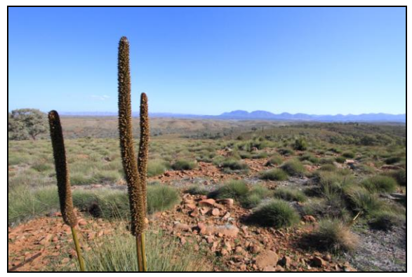
The Flinders Ranges are stunning

the public for a small fee. This includes Horseshoe Top End, Arkapena, Merna Morna, Willow Springs and Sky Trek, Mt Newman and of course Arkaroola with its Echo Back Camp track and Ridgetop trail.