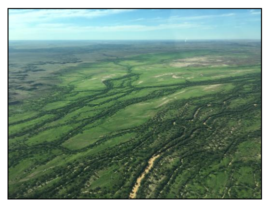
Believe it or not this is desert country north of Birdsville

Eulo, Quilpie, Windorah, Birdsville, down the Birdsville Track, Marree with a flight over Lake Eyre and back via the Strzelecki Track, Cameron Corner, Wanaaring, Trilby station and Louth. Let me know if you would like to see the outback in full bloom.