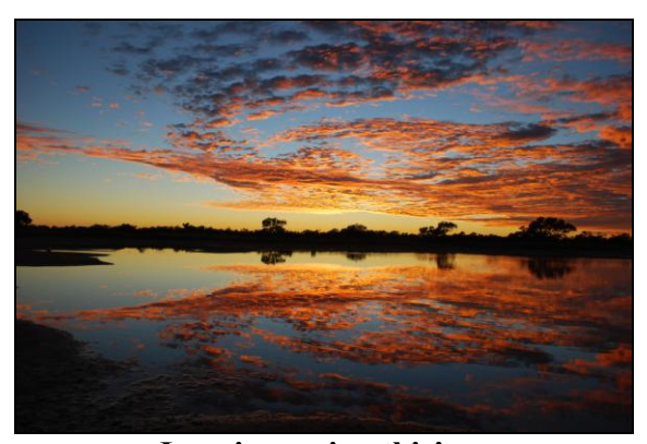
Imagine seeing this!

It will start in Dubbo and head north to Hungerford and Quilpie (passing the areas flooded by the Paroo River), then across the Cooper Creek at Windorah where the bridge was under water just weeks ago. Then into Birdsville which has been cut off twice now by the flooded Diamantina River. Whilst here we will visit Big Red and drive out to Eyre Creek which was in flood during May, by now the flooded sand dunes will be in full bloom and the bird life amazing along the water filled channels of the Creek.