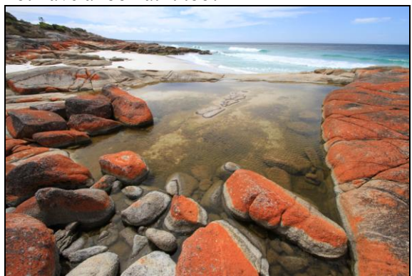
The coast at the Bay of Fires

Well, here is another bucket list item. We all know (don't we?) that Tasmania is not only a great road trip, don't forget I have my 20 day 4wd road trip in November 2019 and I still have spots on the second trip commencing 22 November 2019. But being an island, Tasmania has some of the most pristine, wild and beautiful coastline in the whole country. So I thought why not have a look at it too?