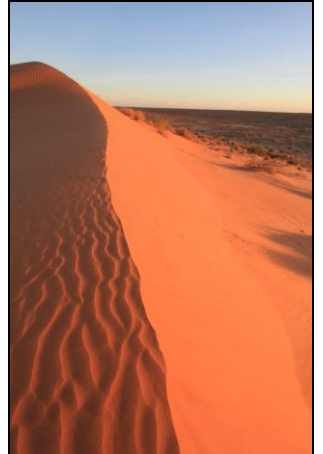
You can't beat this at sunset

On our second trip out to Birdsville the road to Big Red was finally flood free and we were able to see sunset from atop Big Red thanks to Birdsville Adventure Tours, but the flies were in their masses and made any outdoor activity a real battle.