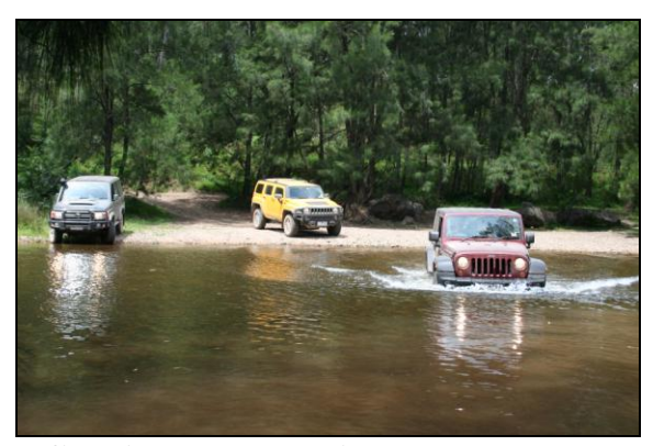
Crossing the Deua River on our long weekend trip

we make camp for 2 nights. Where is this? Just south of Braidwood inland from Moruya, possibly the best camp site in NSW. Some great 4wdriving too.