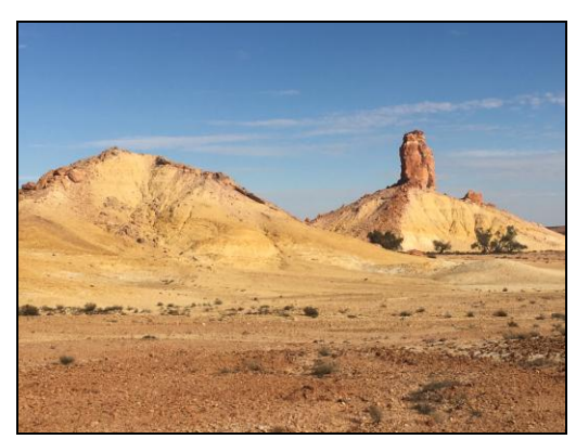
The ground walk at the Painted Hills is sensational

Lunch on day 2 was a giant Oodna Burger at the Pink Roadhouse, again we were rather lonely with very few people travelling as yet. That night dinner was at the William Creek Hotel then on Monday morning we flew out early to land at the Painted Hills for a 3 hour 8 kilometre return walk around this sensational landscape.