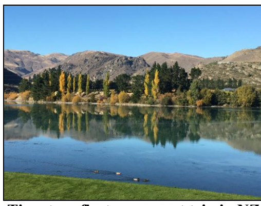
Time to reflect on a great trip in NZ