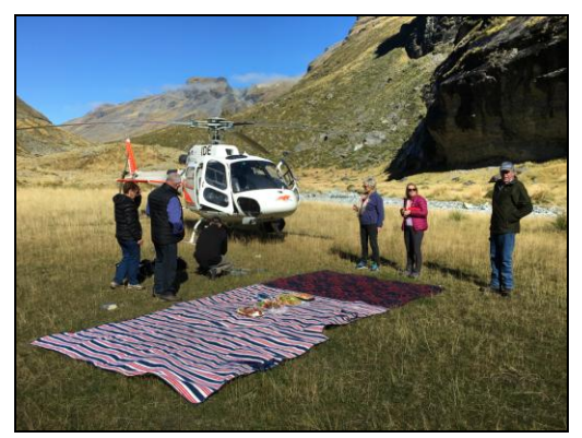
Not a bad spot for a picnic lunch