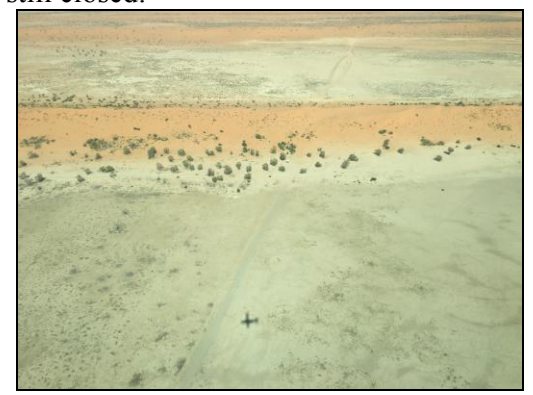
Big Red where we normally drive over it and where 9,000 people will gather in July at the Big Red Bash.

After dinner and breakfast in Birdsville, which was very quiet due to the closed roads all around us, we had a fabulous second day flying over Big Red and then across the Simpson Desert to land at Dalhousie Springs for a very hot swim in the hot spring, needless to say we were the only people there with the Simpson Desert still closed.