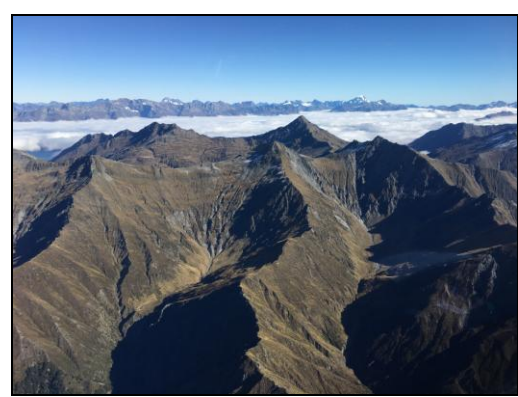
We even did an amazing helicopter flight when in New Zealand

The following are a few photos from our epic New Zealand tour in April