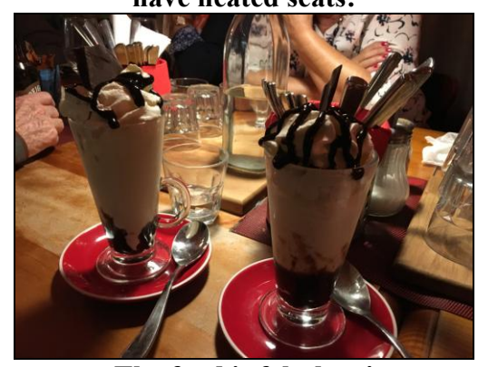
The food is fabulous!

Next New Zealand trip is 28 March to 8 April 2020